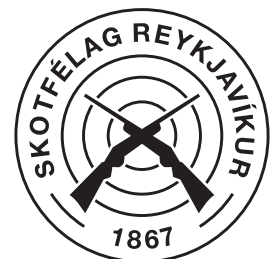
Skorfél. R. Svart/hvít útgáfa