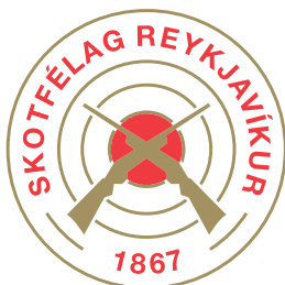
Skotfél. R. Litaútgáfa - tveir litir (rautt og gull)

Skotfélag Reykjavíkur Frumútgáfa merkis í lit