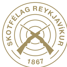
Skotfél. R. Litaútgáfa - einn litur